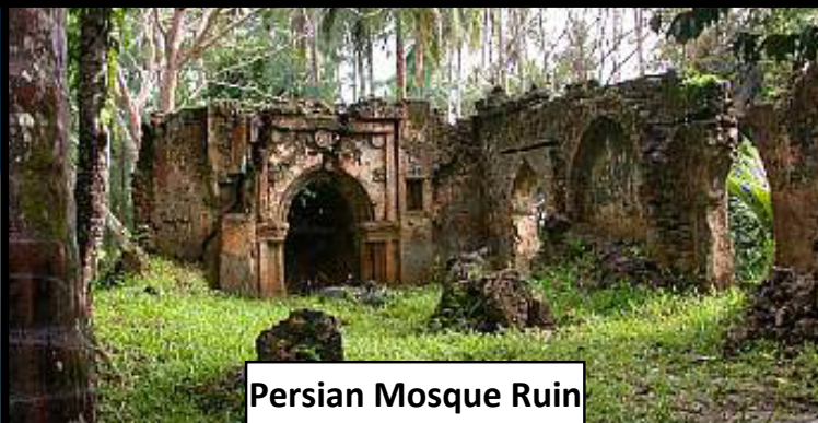
Persian Mosque Ruin

You will be wading in shallow water, so trousers and dresses are not recommended. Carry a hat, sandals and sunscreen.