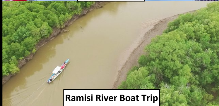
Ramisi River Boat Trip